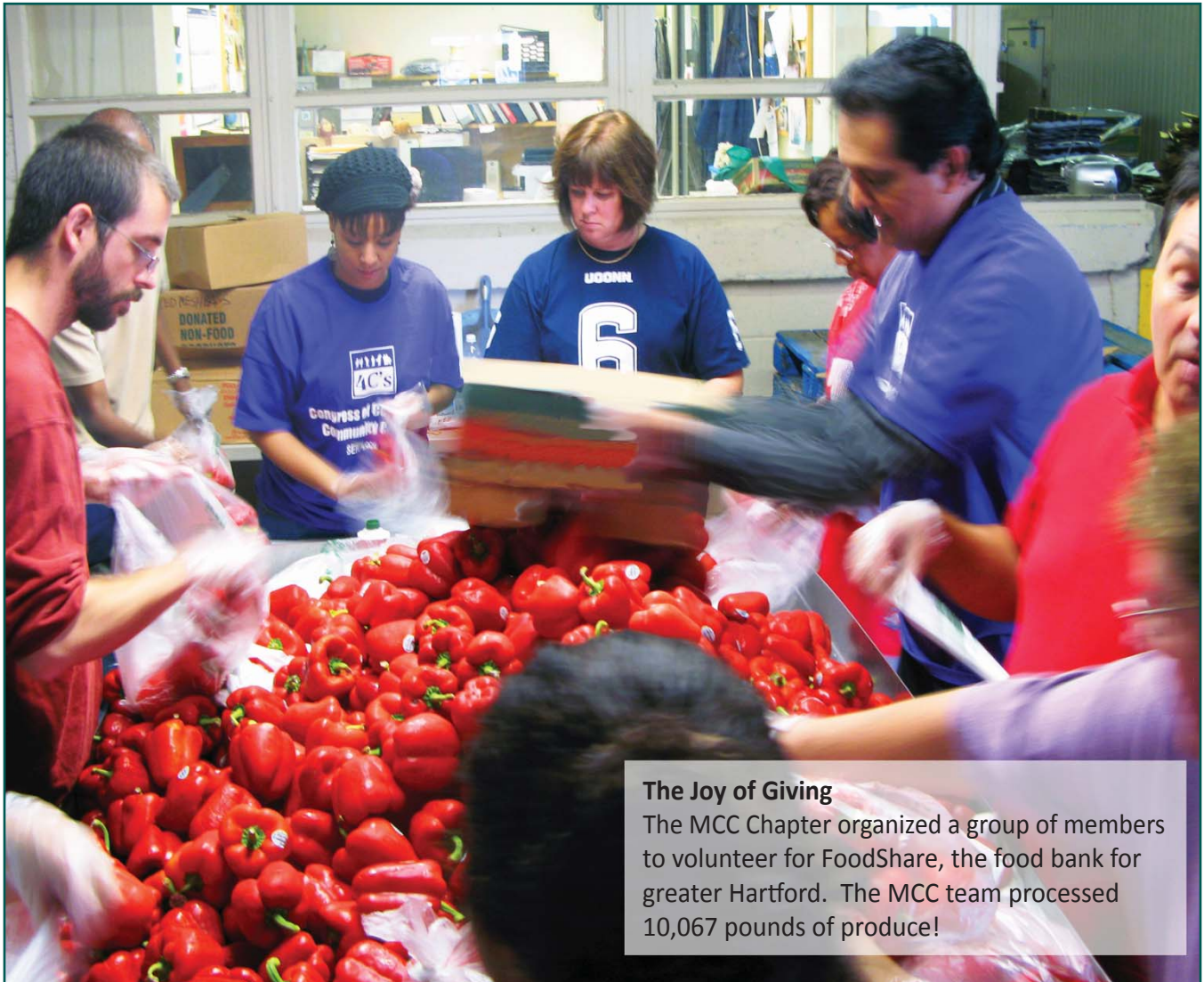
The Joy of Giving The MCC Chapter organized a group of members to volunteer for FoodShare, the food bank for greater Hartford. The MCC team processed 10,067 pounds of produce!

News from the Congress of Connecticut Community Colleges, SEIU Local 1973 • Dec. 2010