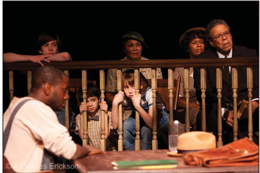
from the Hartford Stage production of "To Kill a Mockingbird"

When Zakiah played the part of a townsper-son witnessing the trial of a falsely-accused Black man, she took it