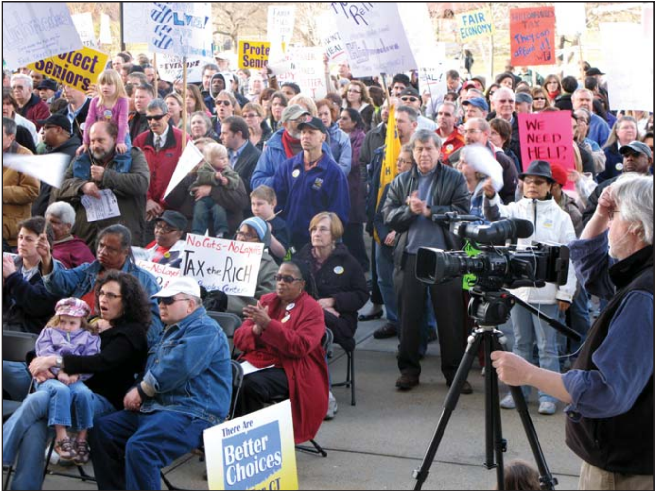
4C's members joined hundred of state employees and community service advocates at a State Capitol rally in March. Participants urged legislators to consider ways to raise revenue rather than make drastic cuts in state services.